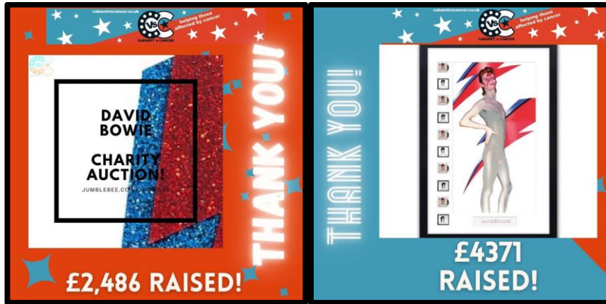
David Bowie Auction '22