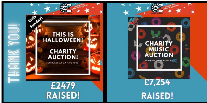
Halloween Auction '21