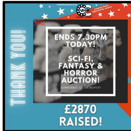
Sci Fi Auction '21